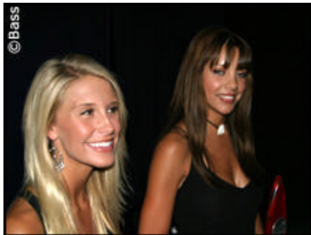
Beautiful ladies, a SURFER Poll tradition